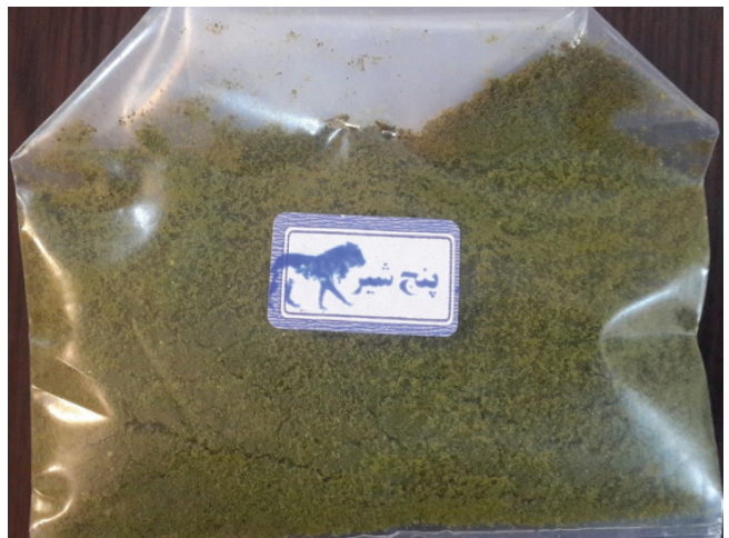
Figure 4. Panjshir nass in its original packaging. The word Panjshir means 'five lions'. Panjshir is a bulk form of Afghan nass that is used in some regions of Golestan province, specifically in Gonbad-e-Qabous. It is composed of ground tobacco, lime, salt, and water. It comes in plastic packages of approximately 50 g. It is more commonly used by younger adults.

Turkmen-Sahra. Purposive sampling was used to allow maximum variation in terms of age, location, occupation and marital status (Table 1). Every participant was interviewed separately. Furthermore, three focus group discussions were carried out, with 4 or 5 participants in each group. The discussions were carried out unplanned and in natural environments (Table 2).