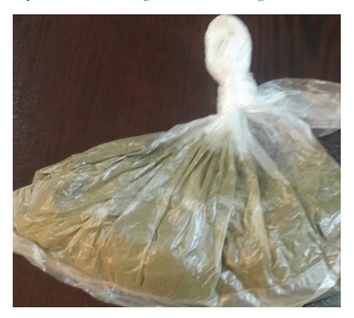
Figure 3. Pesare Malang nass in its original packaging. Pesare Malang is one of the most famous types of Afghan nass and comes in 50 g plastic packages. This brand is more popular among young nass consumers. It is made by mixing ground tobacco with lime, salt, water, and pepper

Figure 2. Bulk form of Turkmen nass. Turkmen nass includes tobacco mixed with ash, salt and water. It is usually consumed by the elderly. Turkmen nass is less expensive and has a lighter color than Afghan nass.